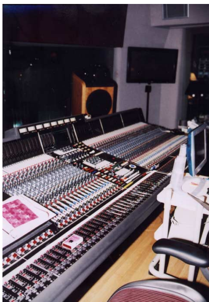
The impressive control board in the sound booth of the Jedi Scoring Stage at George Lucas' Skywalker Ranch.