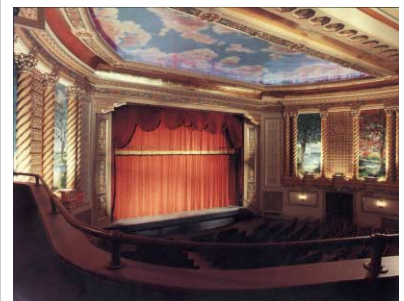
Sandusky Theater was a "jewel box"; a beautifully decorated 1600-seat vaudeville house from the thirties with a huge chandelier. One of five acoustically excellent venues on tour.