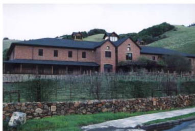
The Jedi Scoring Stage occupies only one wing of this enormous complex at George Lucas' Skywalker Ranch.