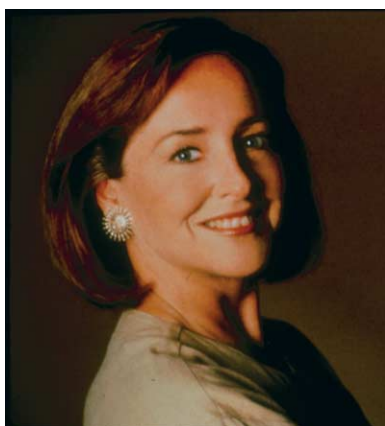
Mezzo-soprano Frederica von Stade